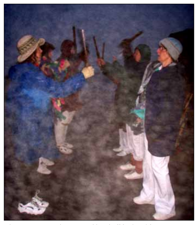
reluctance to stop dancing and head off for breakfast. We didn't see the sun. The mist and cloud parted for only a minute to give us a great view of south eastern Tasmania.